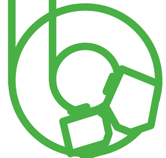
300 cm turning circle - kerb to kerb

Access to all areas: With the efficient articulation, the Park Ranger 2150 has an incredibly small inside turning circle of only 1100 mm allowing the operator to access confined spaces and to operate close to obstacles. Also with the basic machine weighing only 610 kg (with cabin), ground pressure is low enough to be used on sensitive surfaces like lawns and pavements.